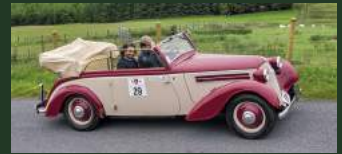
1936 Adler Trumpf 1.7 Cabriolet