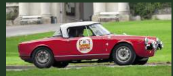
1961 Alfa Romeo Giulietta S.V.