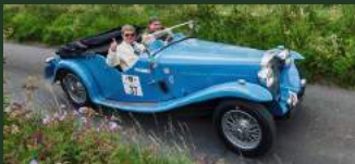
1938 AC 16/80 March Special