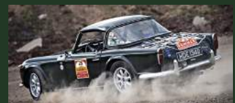
1966 Triumph TR4 A