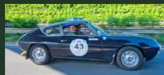
1969 Lancia Fulvia Sport Zagato