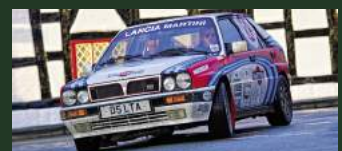
1990 Lancia Delta Integrale