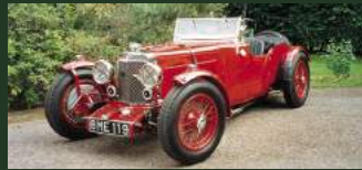
1933 Aston Martin 12/50 Le Mans