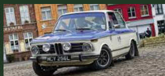
1972 BMW 1602 2 door