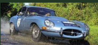
1968 Jaguar E-Type Series 1.5 4.2 FHC