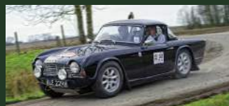
1964 Triumph TR4