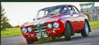
1971 Alfa Romeo GTV 1750