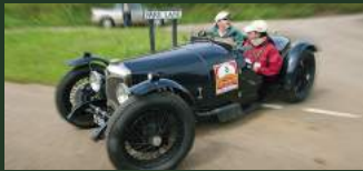
1930 Riley Brooklands 9HP