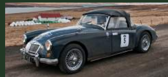
1958 MG A Roadster