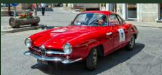
1961 Alfa Romeo Giulietta SS