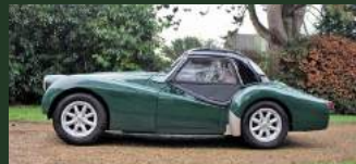
1956 Triumph TR3