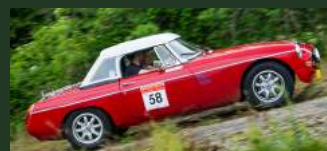
1974 MG B Roadster