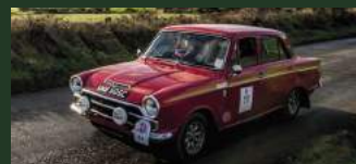
1965 Ford Cortina GT