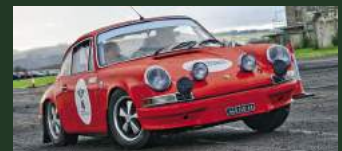
1970 Porsche 911 2.2S