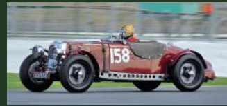
1936 Aston Martin Speed Model