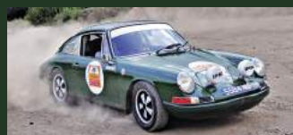
1968 Porsche 911 2.0T SWB