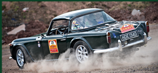
1966 Triumph TR4 A