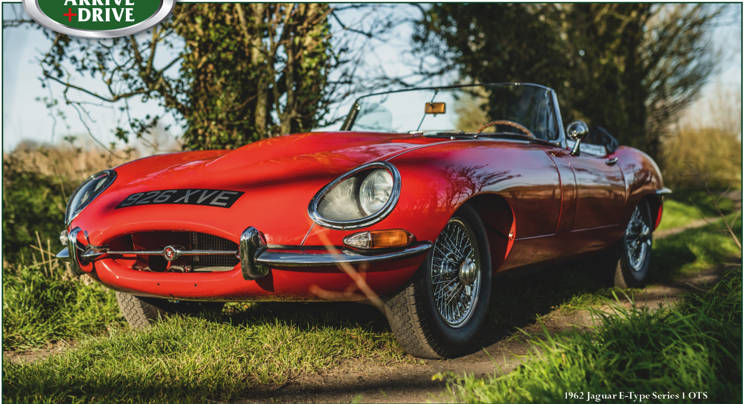
1962 Jaguar E-Type Series I OTS