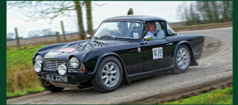
1964 Triumph TR4