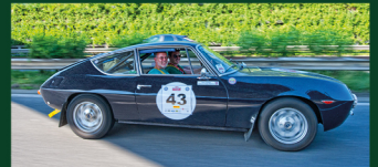
1969 Lancia Fulvia Sport Zagato