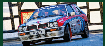
1990 Lancia Delta Integrale