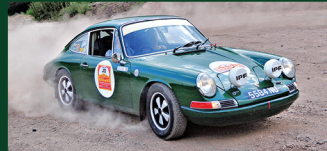
1968 Porsche 911 2.0T SWB