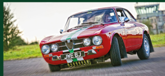
1971 Alfa Romeo GTV 1750