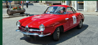
1961 Alfa Romeo Giulietta SS