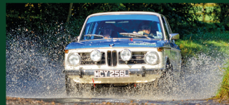
1972 BMW 1602 2 door