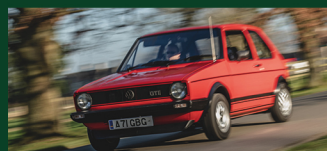
1983 Volkswagen Golf GTI Mk1