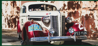
1938 Buick Special