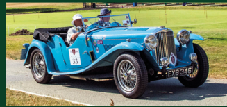
1938 AC 16/80 March Special