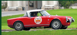
1961 Alfa Romeo Giulietta S.V.