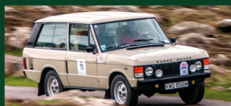
1980 Range Rover Classic 3.5 V8