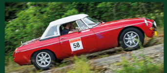
1974 MG B Roadster