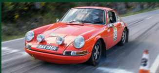
1970 Porsche 911 2.2 S