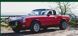
1979 Fiat 124 Sport Spider