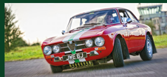
1971 Alfa Romeo GTV 1750