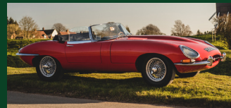
1962 Jaguar E-Type Series 1 OTS