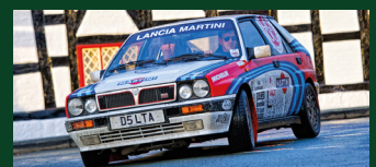
1990 Lancia Delta Integrale