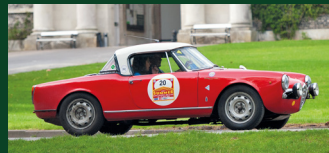
1961 Alfa Romeo Giulietta S.V.