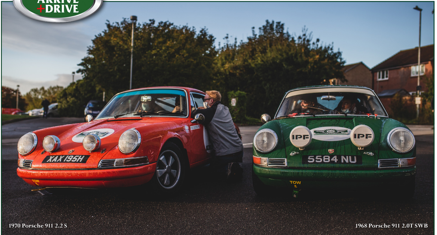
1970 Porsche 911 2.2 S