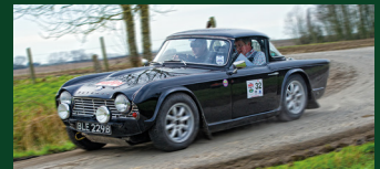
1964 Triumph TR4