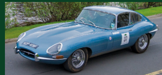
1968 Jaguar E-Type Series 1.5 4.2 FHC