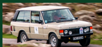
1980 Range Rover Classic 3.5 V8