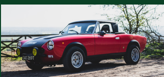
1979 Fiat 124 Sport Spider