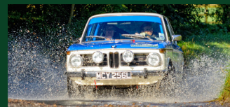
1972 BMW 1602 2 door