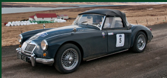
1958 MG A Roadster