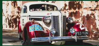
1938 Buick Special