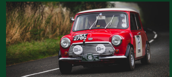
1968 Mini Cooper