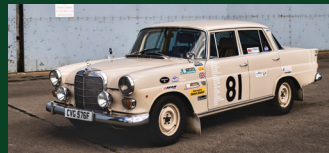
1968 Mercedes Benz 230 Fintail