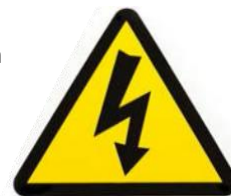
Drawing 5.14 - Minimum size 75mm x 75mm

For vehicles other than racing cars that are not fitted with enveloping bodywork any side exhaust may not extend beyond the plane through the outside of the front and rear tyres with the front wheels in the straight ahead position. Cars of Periods A to E and Drag race vehicle are exempt from these requirements.