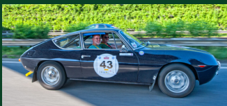
1969 Lancia Fulvia Sport Zagato