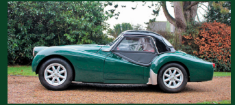
1956 Triumph TR3