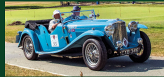
1938 AC 16/80 March Special