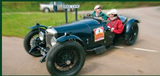
1930 Riley Brooklands 9HP