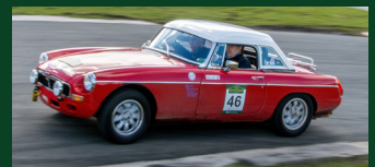
1974 MG B Roadster