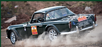
1966 Triumph TR4 A