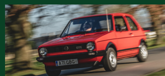
1983 Volkswagen Golf GTI Mk1